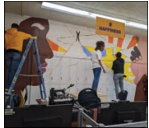
AUGUST MARTIN High School students in Queens worked with Doing Art Together in the spring to create this stirring mural, located in the computer lab classroom.